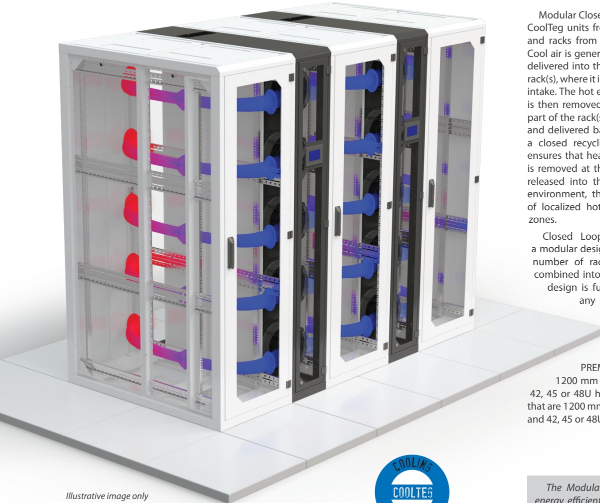
Illustrative image only

Modular Closed Loop offers the ability to achieve up to 35 kW of cooling power per rack per assembly. This type of architecture can be especially useful when planning to install a few very high-power racks into a facility since the racks do not release any heat into the data center environment. It is also an ideal solution when limited rack space (for example, in atypical server room of a mid-size company) is required, but cooling becomes an issue because of the high-density applications housed there.